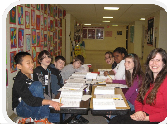
The kids had fun in Sunday School!