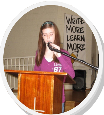
Reading a Valentine poem