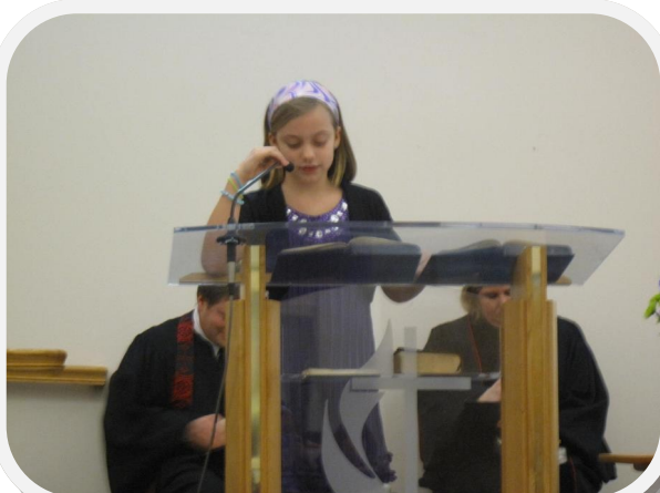
Joint Ash Wednesday Service at Jackson United Methodist Church